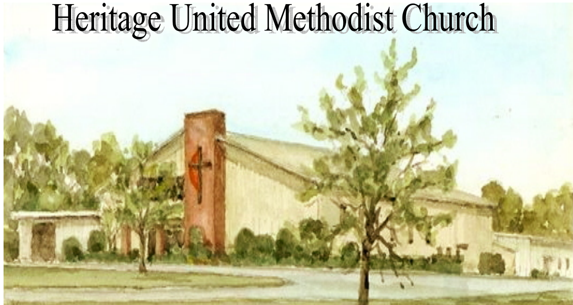
“At the intersection of God’s Grace, and Your Needs”